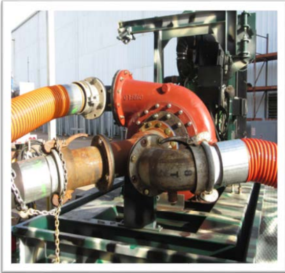
(2) 8" Suction Lines