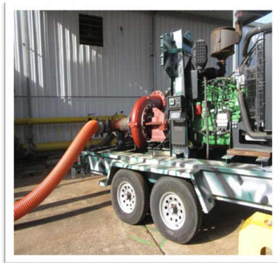
Flow reading @ 900rpm is 1,523.57gpm.