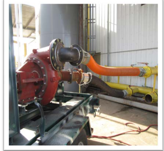
(1) 8" Discharge Line