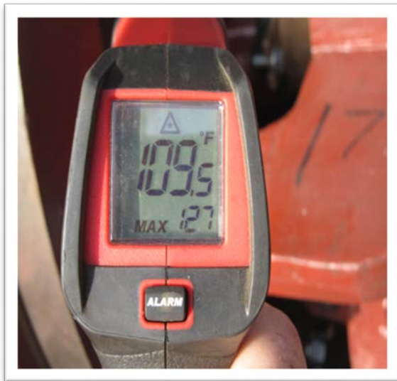
Bearing Temperature Reading