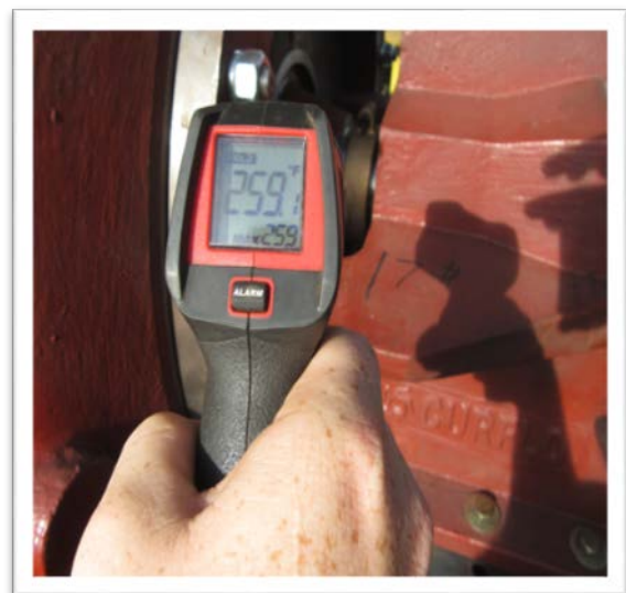
Seal Temperature (Towards Shaft End)